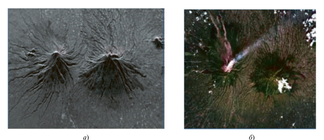
Fig. 2. Comparing of a radar picture and picture in an optical zone of a range: a – TerraSAR-X (the SCANSAR mode, spatial resolution is 16 m); b – Landsat-7 (combination of channels: 3-2-1, spatial resolution is 30 m)

Two images which are visually showing the considerable differences in shooting geometry between radar data and data in an optical zone of a range are given in a figure 2.